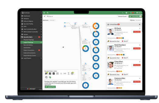
Intuitive easy to use view into the network and endpoint vulnerabilities

Learn more about what's new in FortiOS. <a href="https://www.fortinet.com/products/fortigate/fortios">https://www.fortinet.com/products/fortigate/fortios</a>